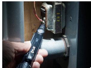
High sensitivity mode for low voltage systems like doorbell transformers