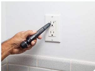
Detect voltage quickly and easily