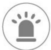
Four alarm methods