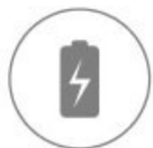
Large capacity battery