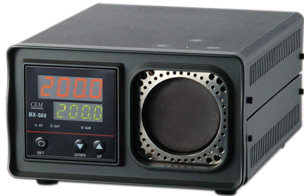
Gradient between probe and IR surface