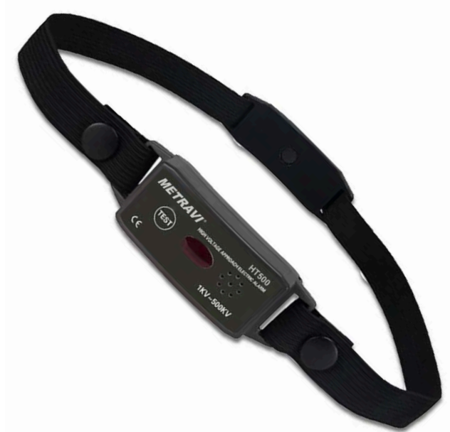
The Detector is to be worn on the helmet of the working personnel, with the front face of the alarm facing out.