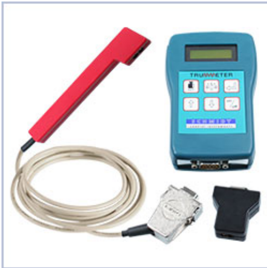
Model RTM-400 inclusive 2 sensors